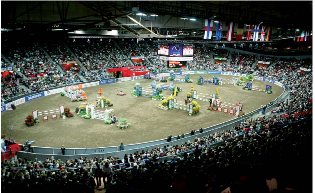
The Scandinavium Arena, Gothenburg